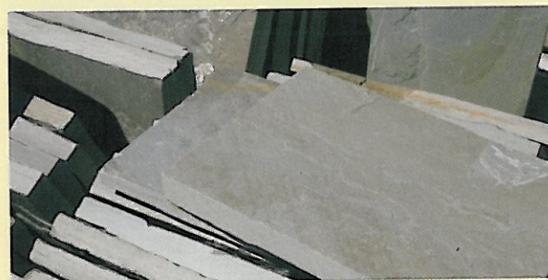
The horizontal hardscape material will be bluestone, except where I have noted quarter-minus gravel.

I decide to construct the greenhouse of recycled materials. The construction and materials will depend on what I find at a salvage center. The